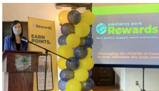
City of Monterey Park Launches Reward App