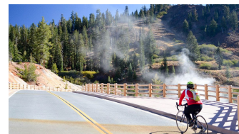
ATP Cycle 6 Guideline Development