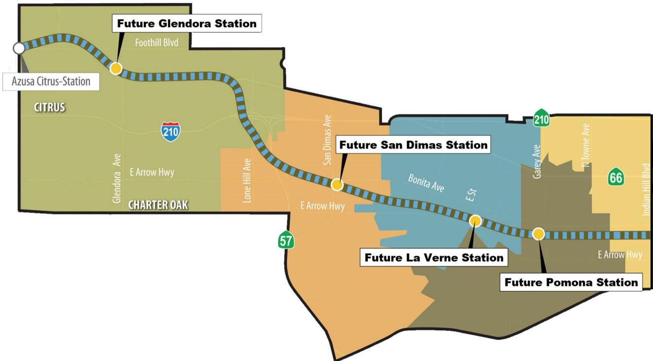
Project Map: Gold Line Extension from Azusa to Pomona Metrolink Station

Additional details regarding the Foothill Gold Line can be found on foothillgoldline.org . Questions and inquiries can be directed to (626) 471-9050.