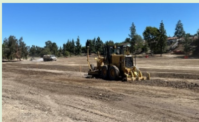
Grading new fairways, bunkers, and greens