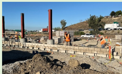
New maintenance facility under construction

The new maintenance facility is taking shape and grading crews are roughing out new fairways, bunkers, and greens for those holes that were relocated to make room for the SR-57/SR-60 Confluence Project improvements. All work continues to progress, and the course is on target to reopen in 2023.