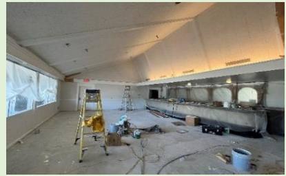
Pro Shop Café Bar Area

Work to provide a fresh look to the Café, Bar and Pro Shop area is underway.