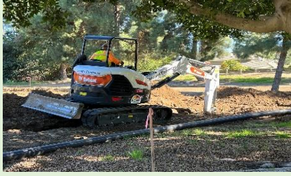
Grading new fairways