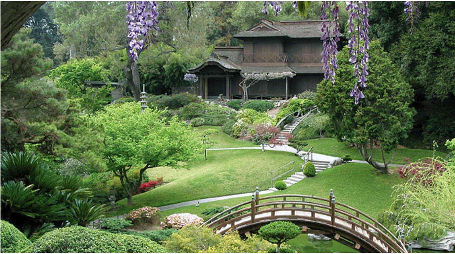
Huntington Library and Gardens (San Marino)