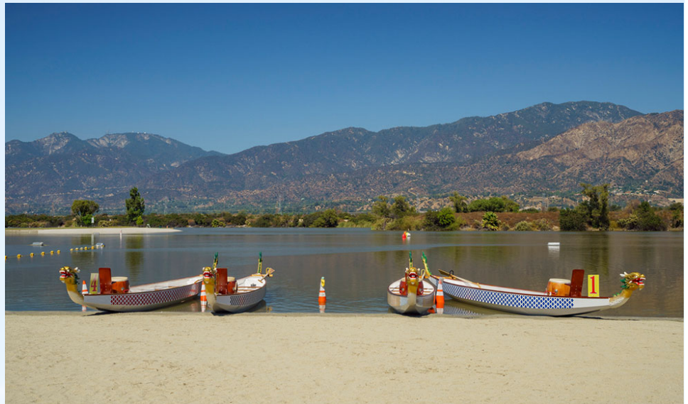
Santa Fe Dam Recreation Area (Irwindale)

Valley Voice The Pulse of the San Gabriel Valley